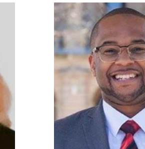
MAYOR FRANK WHITFIELD ELYRIA