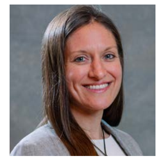
Mayor Nicole Condrey Middletown