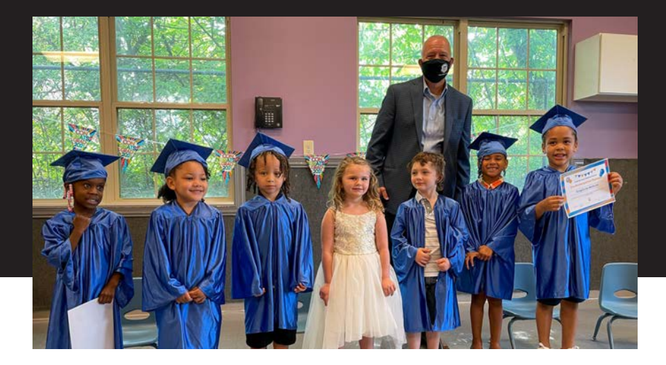
Mayor Dan Horrigan, City of Akron, at McKinley Early Childhood Education Center preschool graduation