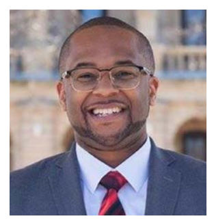
Mayor Frank Whitfield Elyria