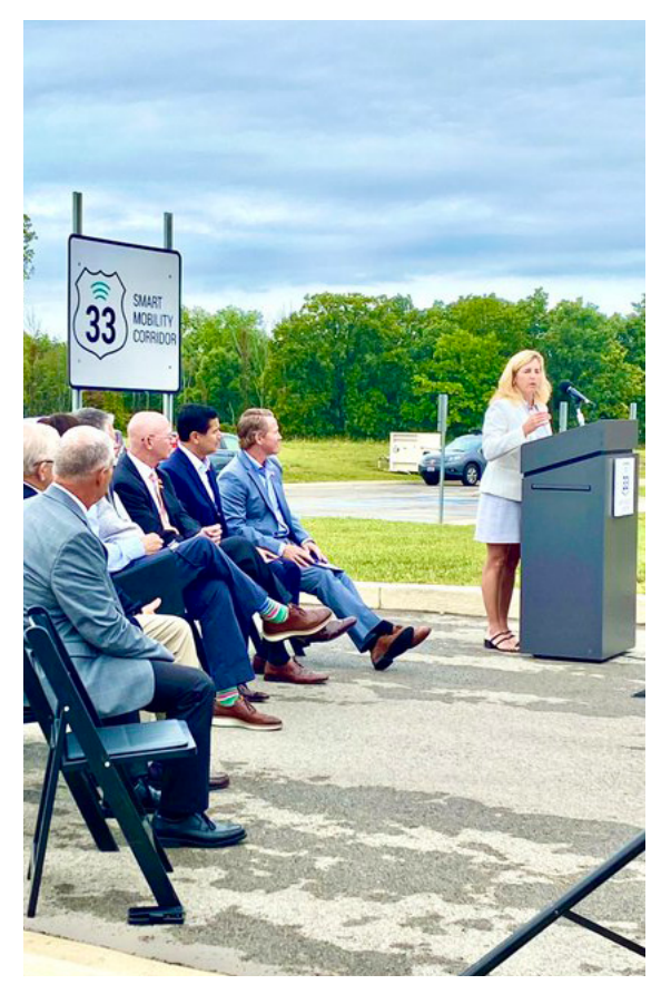
Mayor Chris Amorose Groomes, City of Dublin (Right), opening the 33 Smart Mobility Corridor