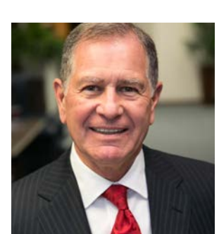
MAYOR JACK BRADLEY LORAIN