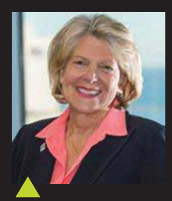
FORMER CLEVELAND MAYOR JANE CAMPBELL