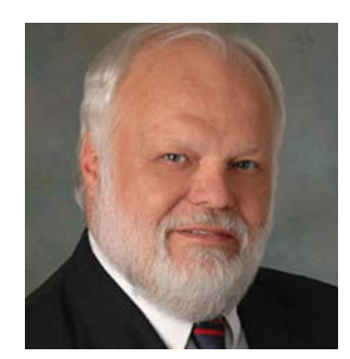
Mayor Warren Copeland Springfield